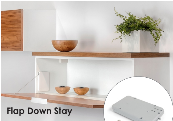
Flap Down Stay